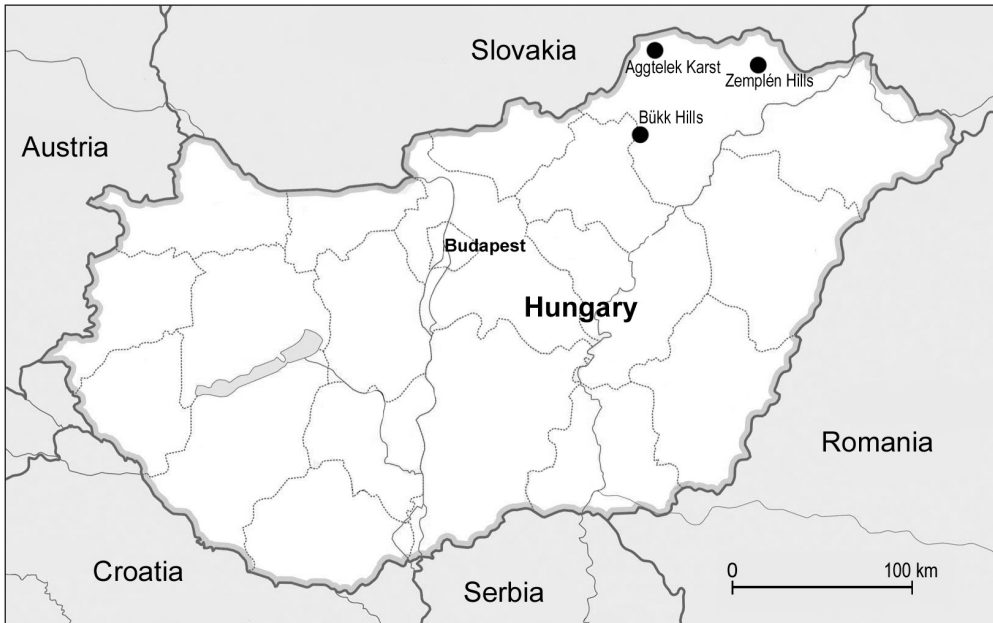
Figure 1. The three study areas in north-east Hungary 1. ábra A három vizsgálati terület ÉK-Magyarországon

Woodpecker nest sites may be quantitatively described by examining the characteristics of the nesting tree (Hågvar et al. 1990). This study was restricted to nest cavities excavated and used by White-backed Woodpeckers in Hungary. The main aims of this study were to characterize cavity trees used by this species including the tree species, its state of decay,