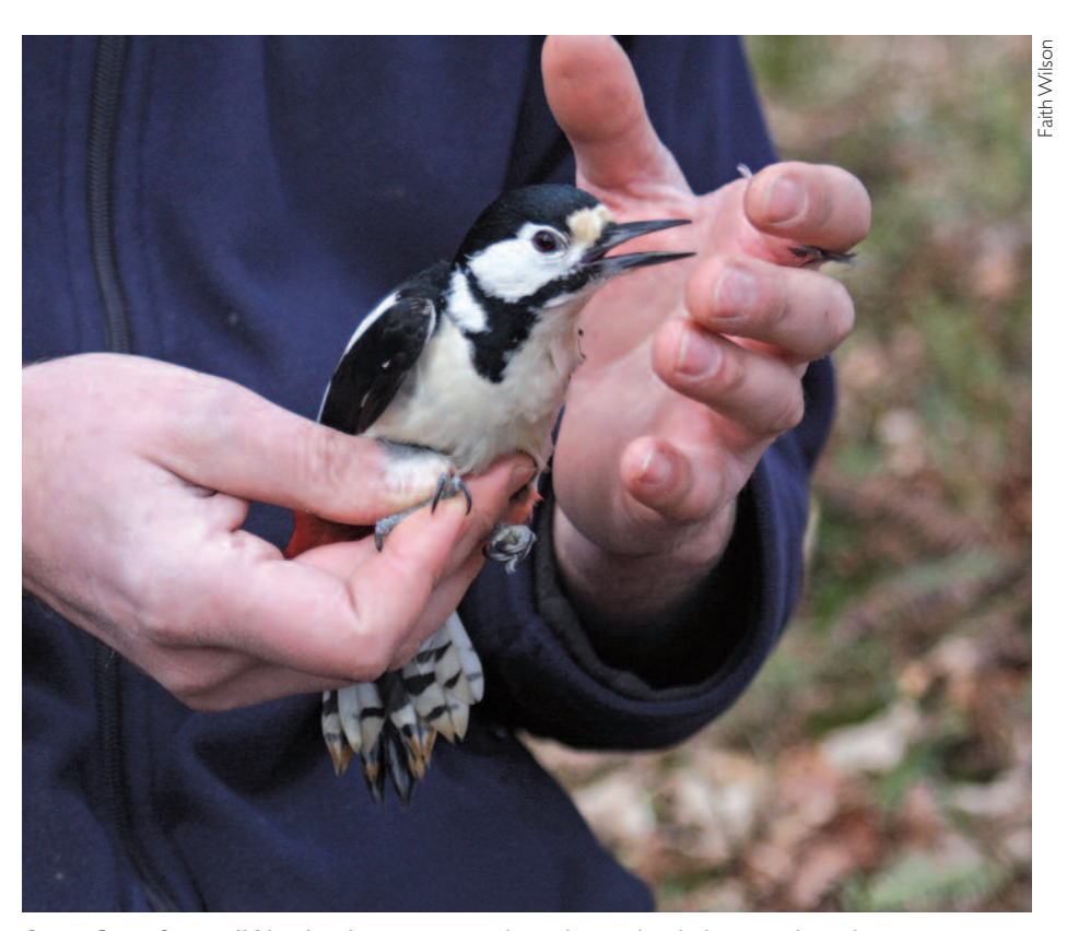
Some Great Spotted Woodpeckers were caught and ringed to help in tracking their movements.

The world distribution of this woodpecker stretches in a massive swathe from the Canary Islands in the west, right across to Japan in the east, taking in all of Europe and much of North Africa, Russia and Asia. Prior to the recent colonization in this country, breeding did not occur in Ireland, and the species was also absent from the Isle of Man and Iceland. The species' north/south distribution extends from arctic taiga forest, through to temperate, alpine forest and Mediterranean regions.