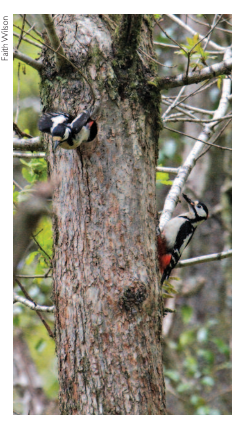
Pair of woodpeckers at nest site.